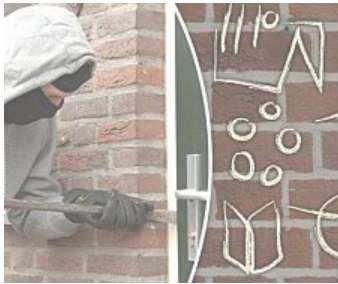
REVEALED: The signs and symbols burglars are using to mark YOUR home before... (The Express)