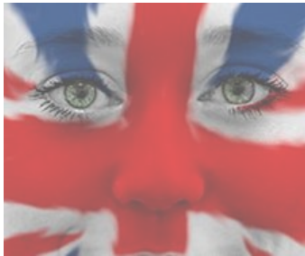
Too difficult for English native speakers? Test your knowledge of collective nouns! (Babbel)