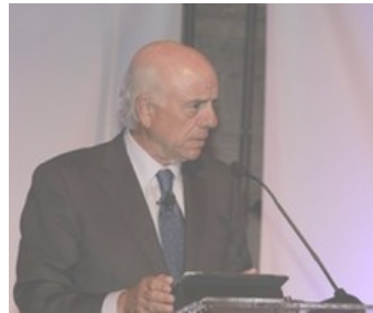
Many conventional banks are going to fall by the wayside (BBVA)